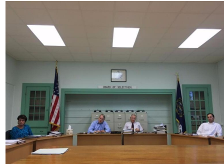
Bow Select Board Members

The Select Board also clarified that while dogs are not required to be leashed, the law requires that they are under control (which means under voice command or on a leash).