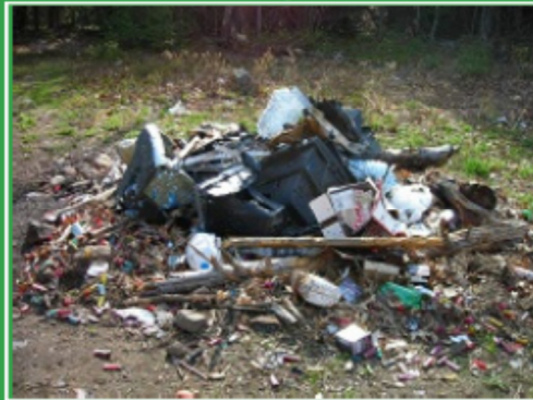
Trash in the forest. April 2012

What a disappointment to see the careless disregard with which some people treat our wonderful outdoor spaces.